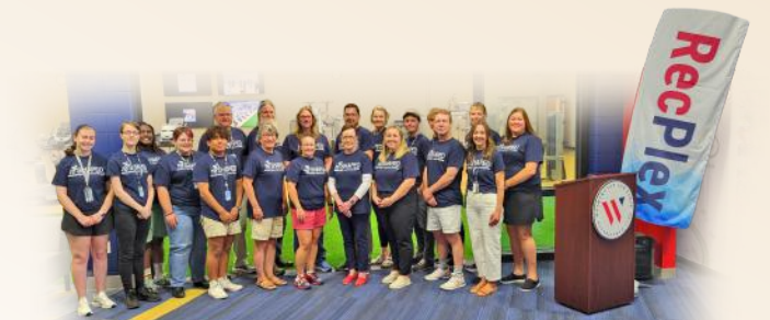
Photo: RecPlex team celebrates renovated fitness center opening

Our Recreation Department is continuously building strong community connections by investing in initiatives, events, and activities that improve our quality of life and inspire a sense of belonging. The community voiced their support of the department in May with the passage of a replacement levy for recreation services . The additional revenue will be used to fund infrastructure repairs as well as improvements to Countryside Park. Asking for a levy increase is not something we take lightly. A great deal of planning, budgeting, and cost analysis goes into the decision and the final approval ultimately rests with the voters. We always operate with the residents' best interests in mind, and we are grateful for your support.